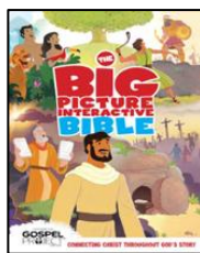
Age 2-5, Page 146

Family Devotional: Our desire is for kids to hear from the Bible first at home and then have the message be reinforced at church on the weekend. In addition to, or in lieu of the provided story, you can use these devotionals with your family. These can be purchased in the Berean Café.