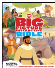
Age 2-5, No Story

Family Devotional: Our desire is for kids to hear from the Bible first at home and then have the message be reinforced at church on the weekend. In addition to, or in lieu of the provided story, you can use these devotionals with your family. These can be purchased in the Berean Café.