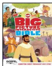
Age 2-5, Page 150

Family Devotional: Our desire is for kids to hear from the Bible first at home and then have the message be reinforced at church on the weekend. In addition to, or in lieu of the provided story, you can use these devotionals with your family. These can be purchased in the Berean Café.