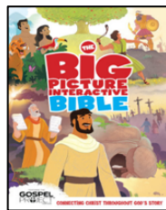
Age 2-5, Pages 154

Family Devotional: Our desire is for kids to hear from the Bible first at home and then have the message be reinforced at church on the weekend. In addition to, or in lieu of the provided story, you can use these devotionals with your family. These can be purchased in the Berean Café.